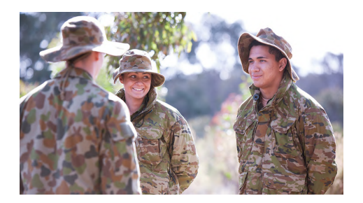
Thursday 27 April 2023