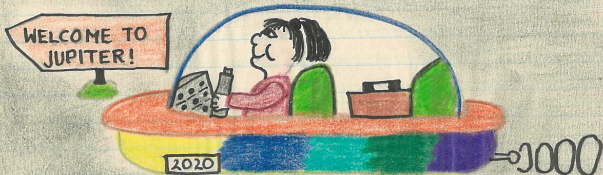
Rainbow glider "IT JUST GLIDES OVER THE RAINBOW"

I think in the year 2020, our world will be much more advanced in technology. Also our environment will be so important, because with all the new technology, people will be more interested in saving the ozone layer and rain forests & there would be more solar power obj. There is a possibility that there could be more pollution with all the construction and buildings. Crime will still be a big problem because of all the new appliances that other people may want. Let's hope that that won't happen and starvation won't be a problem, I'm so fascinated by the extraordinary difference we are making already! We might be flying around in little space shuttles and taking holidays in Jupiter or Mars. I think in the year 2020 we might have a chubbier generation because robots will be doing all the work, and we would be inside all day and not receiving any exercise at all, with the obsession ed with of the internet and modern laptops and computers. There will be no more sickness or diseases and there might be a cure for cancer. I think the year 2020 might be for the better, but who really knows what the future holds?