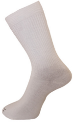
Socks Anklet 2pkt