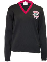
Pullover Yr 12