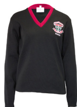
Pullover Yr 12