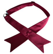
Cross Over Tie